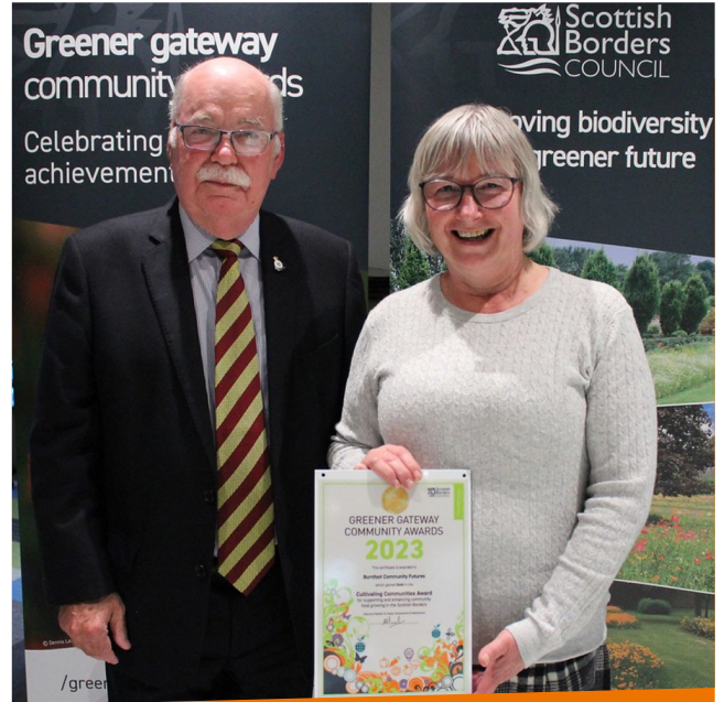
Burnfoot Community Futures