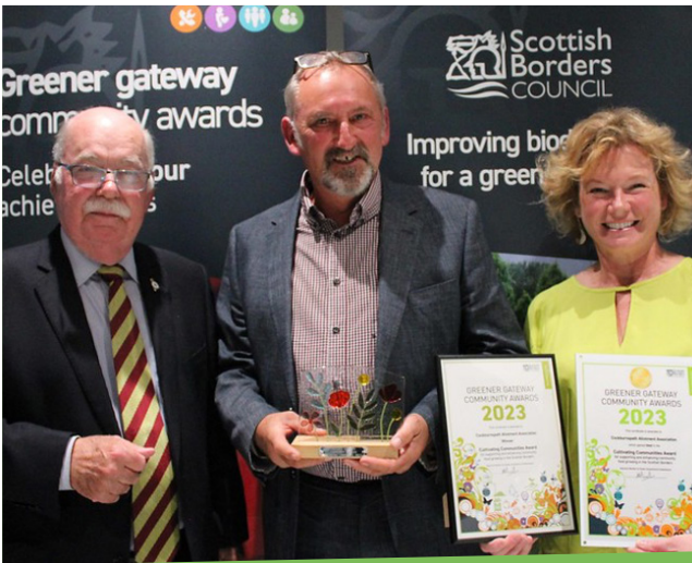
Cockburnspath Allotment Association